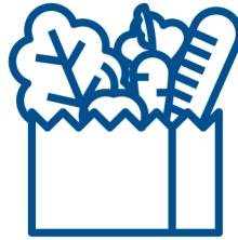
Food Boxes / Bags