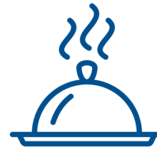
Prepared / Hot Meals