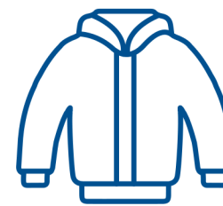
Weather Appropriate Clothing