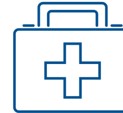
Emergency Supplies & PPE