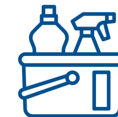
Utility Household Supplies